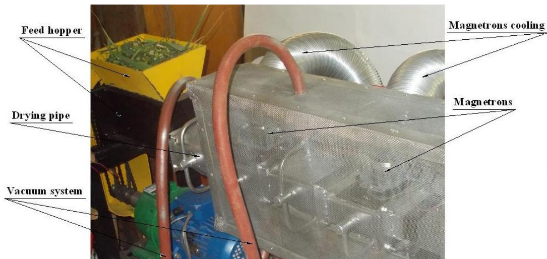
Fig. 2. Laboratory microwave-vacuum drying apparatus

The adequacy of the model has been verified on a developed laboratory microwave-vacuum drying apparatus of continuous operation for drying the vegetative mass [5] (Fig. 2).